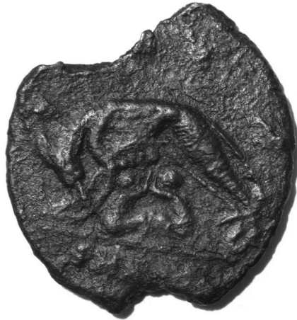
Ancient coin showing Romulus and Remus with the she-wolf.